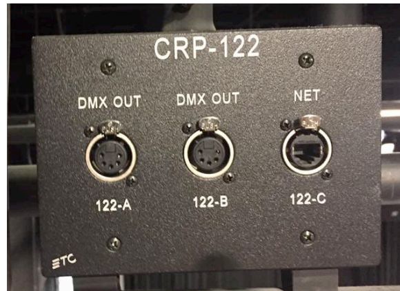
Typical ETC Net3 DMX Out

269-290 – FOH Catwalk 231-268 – DS Pipe Grid 201-230 – US Pipe Grid