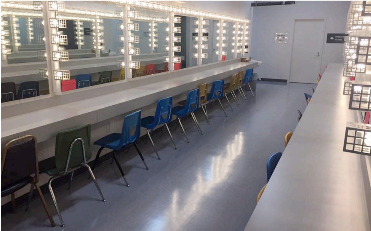
Wilcox Theater Makeup area, VIP rooms are in the background.