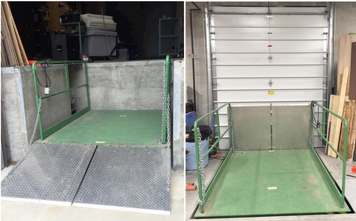
Lift lowered for ground level load-in. Railings are removable.