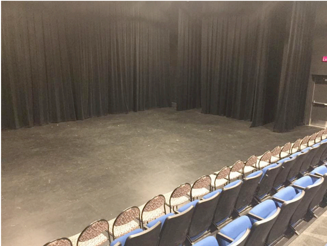
Ives Studio Stage – Note Curtains used as Legs or turned to run US-DS

*Note - The Reif Center has a Marley floor available for use.