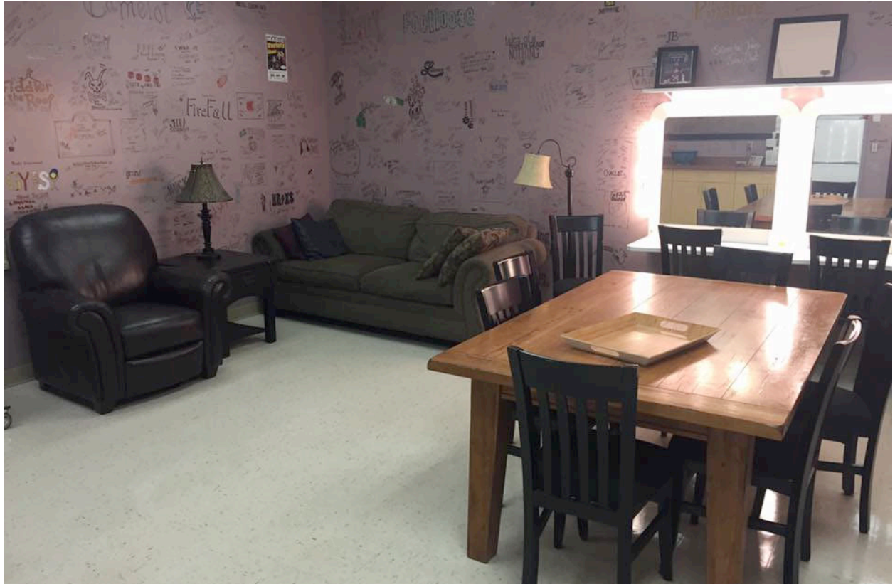
Wilcox Theater Green Room