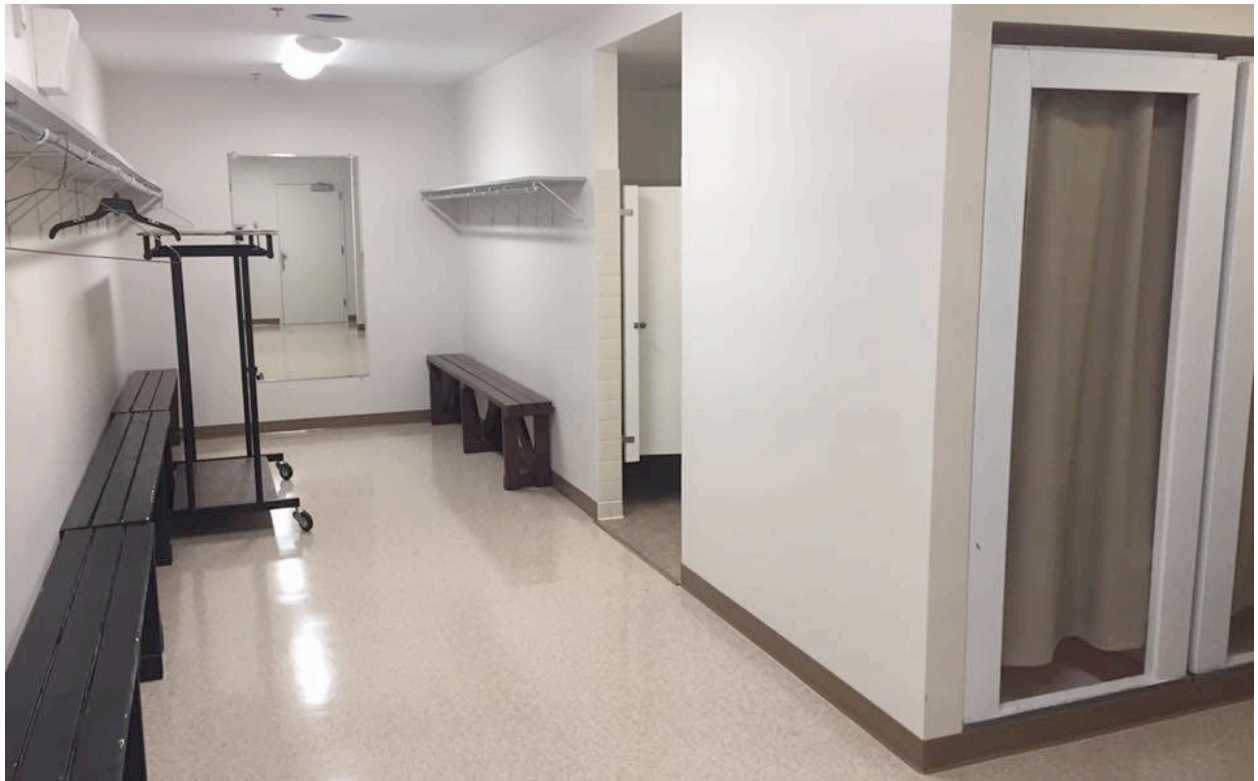
Wilcox Theater Women's Group/Choral Dressing Room