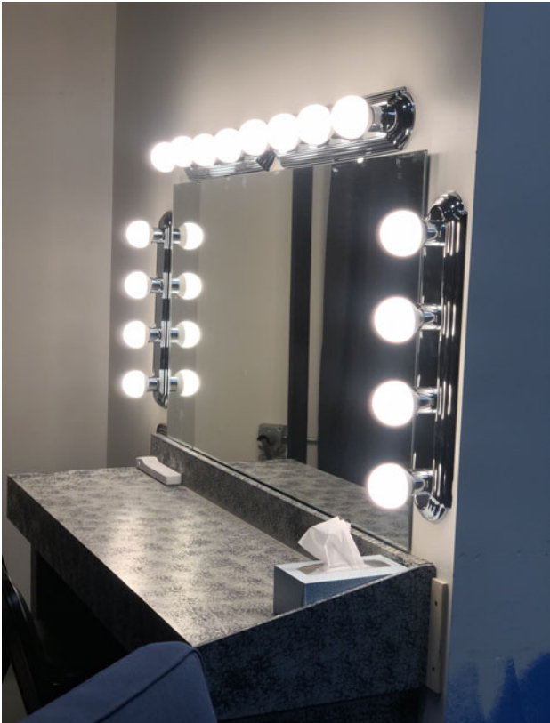
Ives Studio Greenroom. Entrance to stage at upper right.