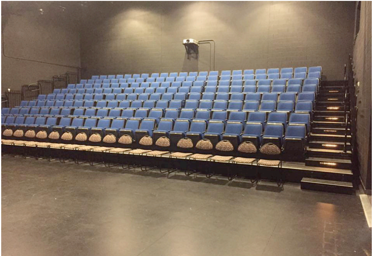
Ives Studio Seating

Seating is retractable and will collapse to a depth of 6' from the wall.